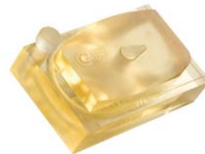
*See Objet Hearing Aid brochure